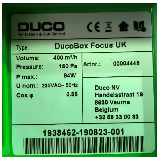
Figure 1 MEV product label