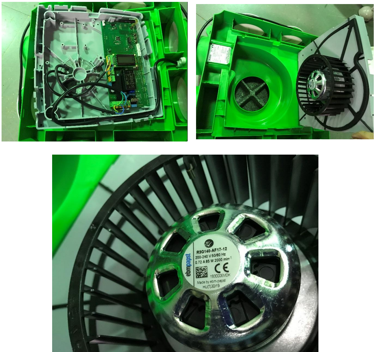
Figure 4 Fan speed control and fan installed in unit.

The fan was controlled from the control board using a stepper set at approximately 3 m 3 /h steps. The room air flow rates were then balanced by opening/closing the room valves to obtain the balance of air distribution between the different wet rooms.