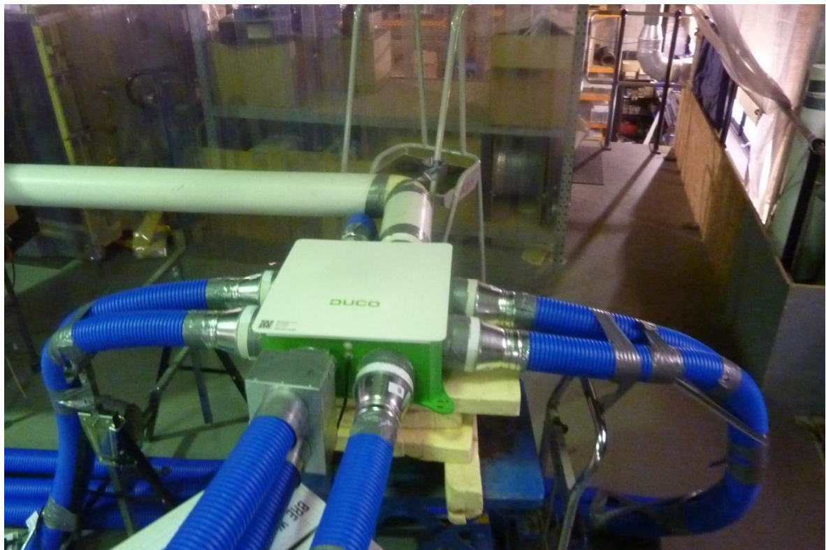
Figure 3 Semi-Rigid duct and plenum installed on MEV unit.